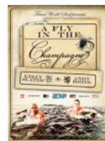
A Fly In The Champagne